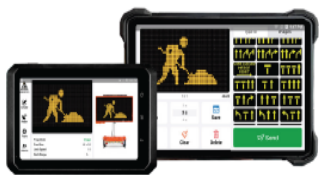
Onsite Tablet Control