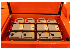
Gel Cell Battery System