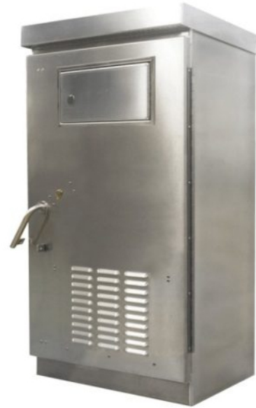
Eagle EL708 Cabinet

Eagle Traffic Control Systems continues our 80+ year history of providing excellence in the ever evolving traffic industry. All of Eagle's products are developed with the highest standards of engineering and manufacturing. Eagle maintains a superior level of integrity in interactions with all of our business partners and customers. We also take tremendous pride in being model corporate citizens.