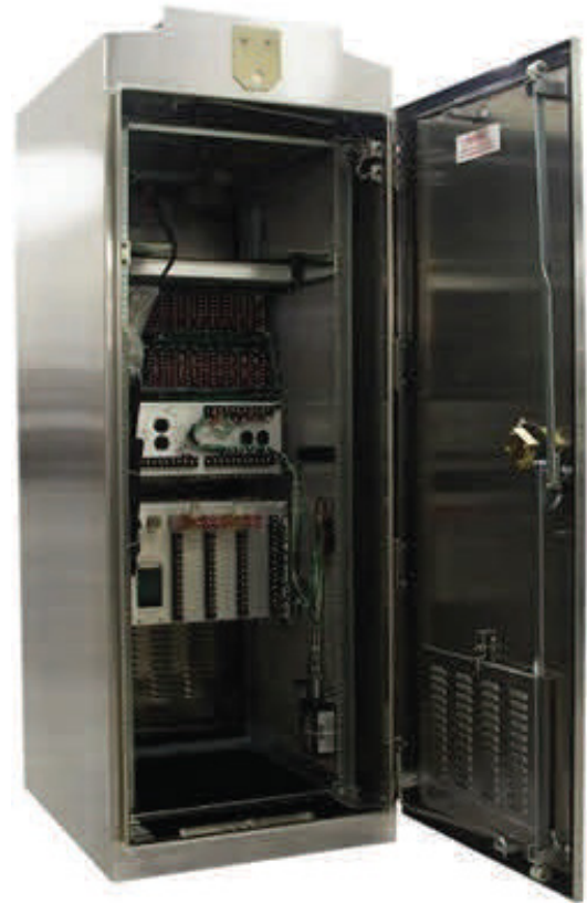
Eagle 332L Cabinet

Eagle Traffic Control Systems continues our 80+ year history of providing excellence in the ever evolving traffic industry. All of Eagle's products are developed with the highest standards of engineering and manufacturing. Eagle maintains a superior level of integrity in interactions with all of our business partners and customers. We also take tremendous pride in being model corporate citizens.