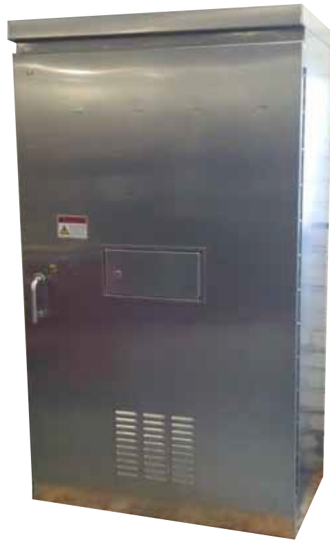
Eagle EL720 Cabinet

Outward-rotating door handle. Double-flanged door frame to provide a better splash shield. Continuously welded enclosure for maximum protection from contaminants. Unique lock/keying combinations. Custom finish per customer requirements. Lifting ears. Two (2) shelves included.